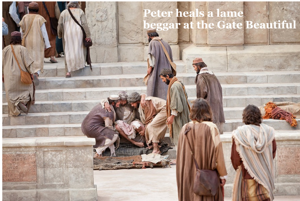
Peter heals a lame beggar at the Gate Beautiful